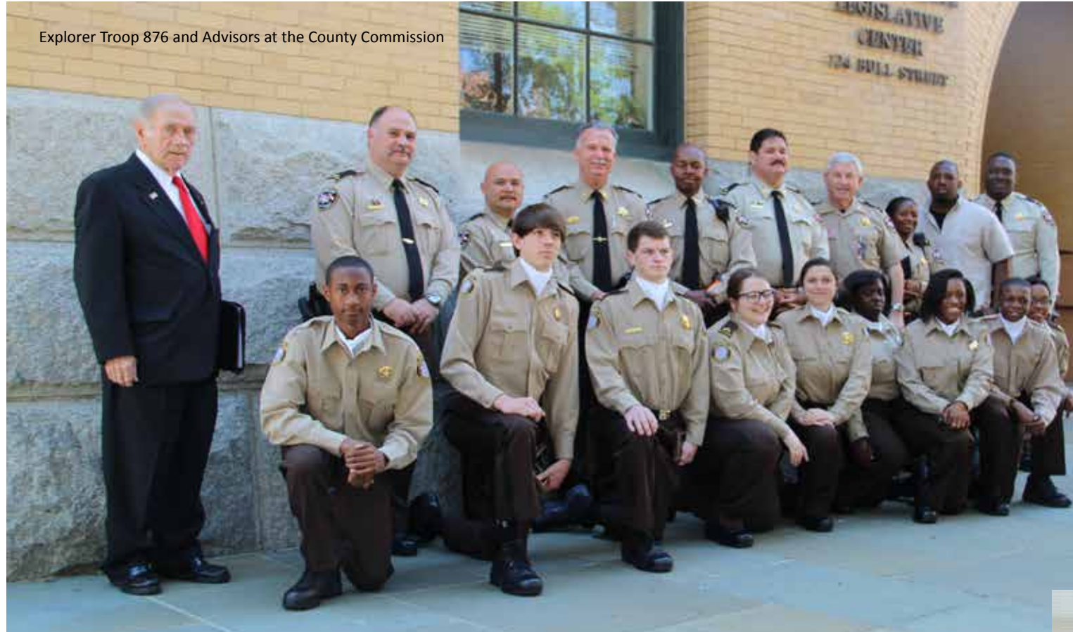
Explorer Troop 876 and Advisors at the County Commission